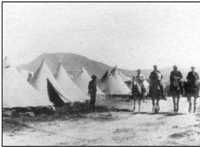
One of three Boer laagers Majuba can be seen in the background.

The first streaks of dawn showed the occupiers of Majuba that the Boer camps in the north and behind Laingsnek were astir with lights in many of the tents and wagons. Away to the right could be seen the Boer left flank positions where the Mounted Squadron had suffered a repulse on 28 January. It was recorded in several diaries of the time and shortly afterwards as a 'thrilling sight'.